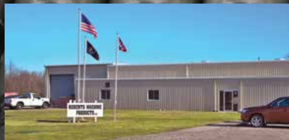
Screw Machine Production Facility 270 Rush St., Rushsylvania, Ohio 43347

Machining quality parts in two locations