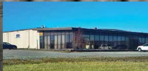
CNC Machining Facility 6800 Co. Rd. 14, West Liberty, Ohio 43357